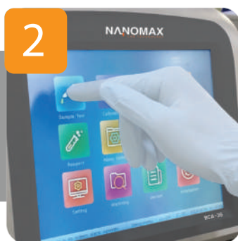
2 Set Parameter