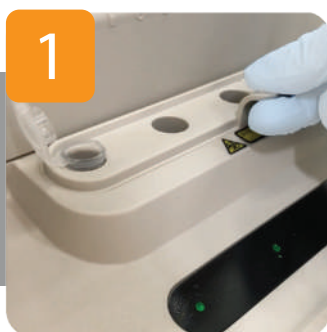
1 Place sample

Easy to operate and maintain with a simple 3-step procedure